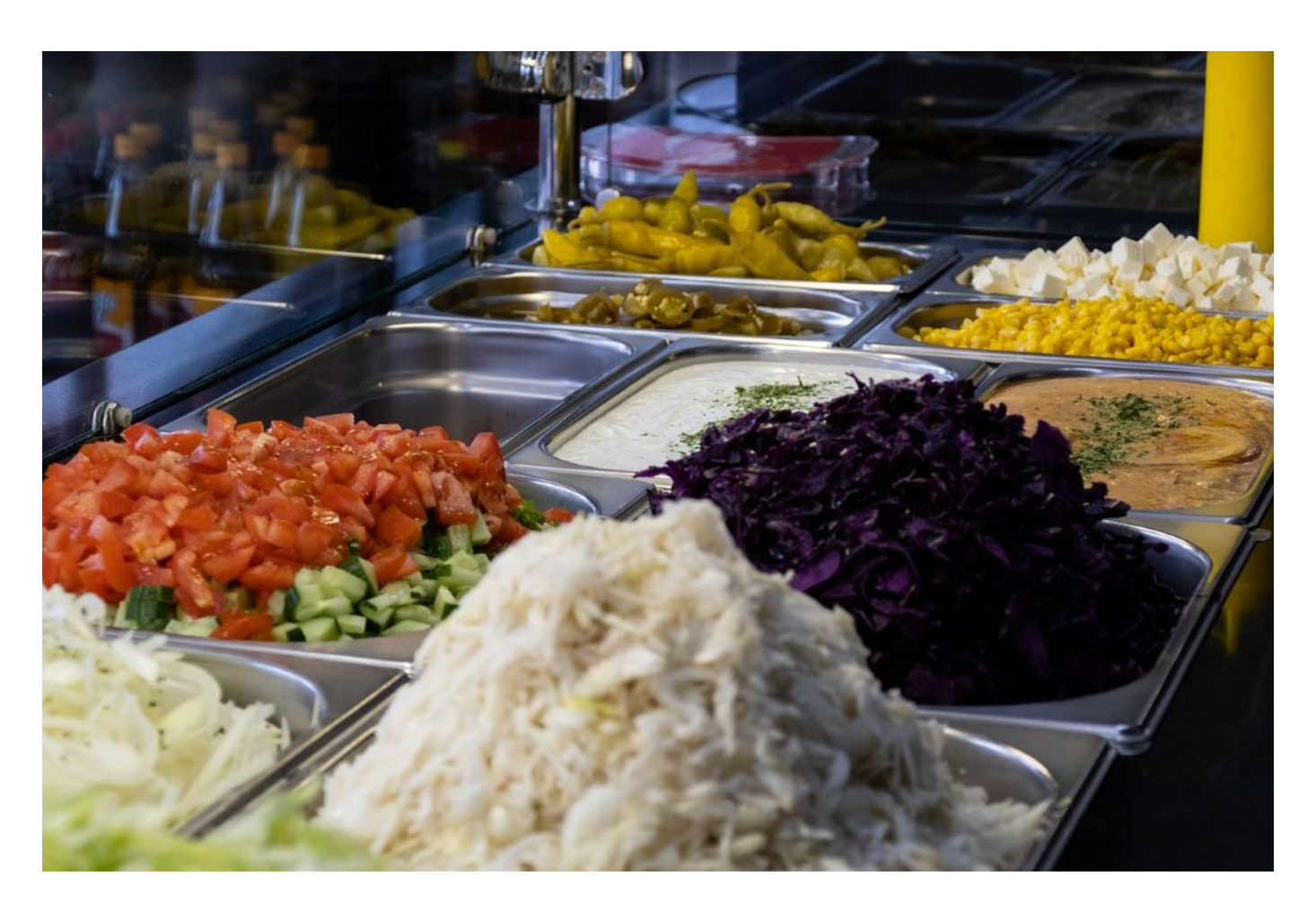
Vegetables and tofu are seen at a cafeteria serving station.

In the university's statement, they said, "USD Dining considers the environmental impacts of their decisions and has taken significant strides to be mindful of our environment. USD Dining is proud of its sustainability efforts."