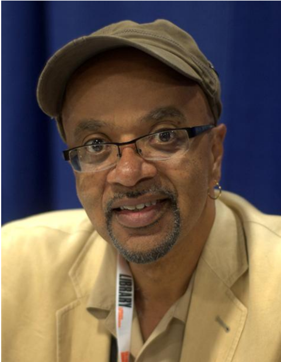
James McBride, author of The Heaven & Earth Grocery Store

After all, the title of McBride's best-selling debut memoir, The Color of Water — about his sprawling, biracial, Christian and Jewish, Northern and Southern family — comes from his mother's response when young James asks "whether God was black or white." And McBride's second book, the World War II novel Miracle at St. Anna , is set in motion by an object resting on a table as if "God had placed it there, which He, in fact, had."