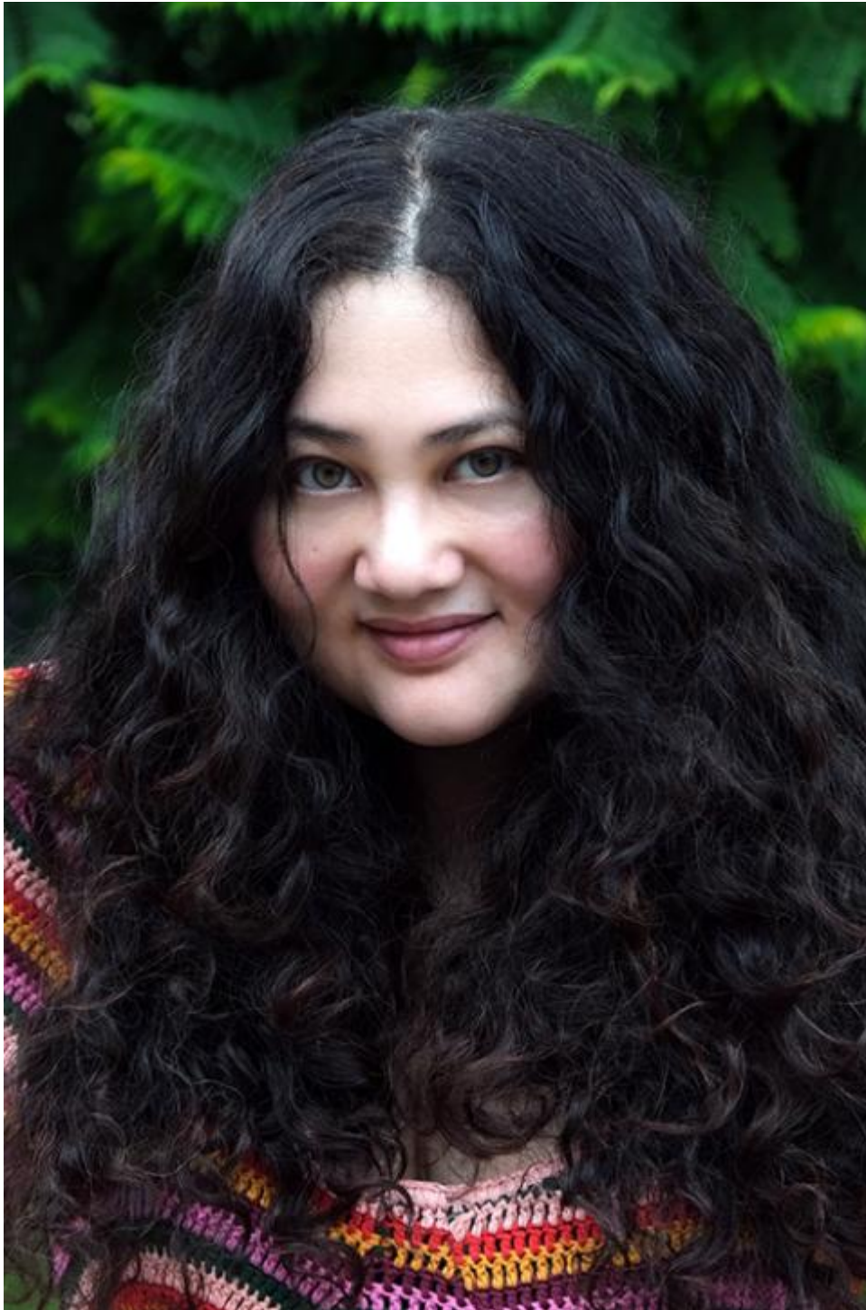
Gabrielle Zevin, author of Tomorrow, and Tomorrow, and Tomorrow

Beyond their initial meeting in the hospital room, Sadie and Sam's friendship sees rifts, fractures and bickering. At times, the two are driven apart — for months or years — by arguments that stem from one or the other's blindness to disparities of wealth, disability, race or gender. Other times, the two meet again in tender